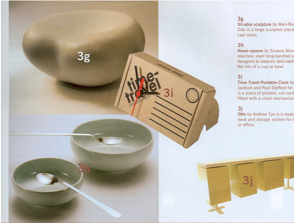
3g Sit-able sculpture by Mari-Ru Oda is a large sculpted piece cast stone.