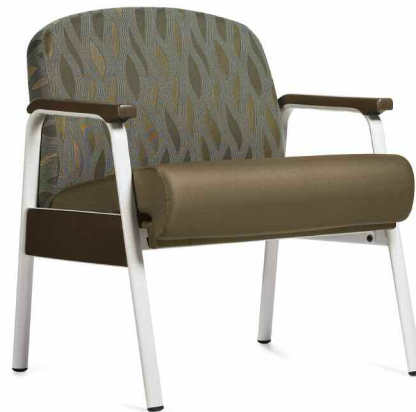
GC4871 Careflex bariatric single lounge chair.

Careflex incorporates safety, functional simplicity and value without compromising comfort. Specially designed for acute and senior care facilities, the Careflex's 1.5" sleek oval metal frame can endure the most rigorous environment. Unique solutions include Bariatric Seating warranted to 750 lbs and "Weighted" Seating options. The powder coated epoxy paint finish ensures exceptional durability in both public and private room settings. A wide range of product,