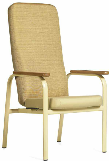
GC7605 Careflex high back chair.