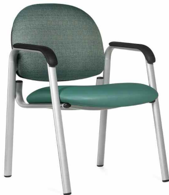
GC4895 Careflex low back chair.