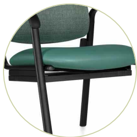
Certain applications are made safer with the addition of weight to the product.

Above: GC7605 seat back shown in Mayer, Brio Wheat (WC783-002), seat in CF Stinson, Chrome Champagne (CHR10), arms in Fruitwood (TFM), frame finish in Caramel Cream (CRC). GC4895 seat back shown in Mayer, Brio Aquamarine (WC783-014), seat in CF Stinson, Matrix Alpine (MA114), arms in (SSU), frame finish in Tungsten (TUN). Above (and Cover): GC4871 seat back shown in Momentum, Emanate Latte (09103235), seat in Momentum, Max Rum (09092510), arms in Cocoa Vanilla (CVM), frame finish in French Vanilla (FRV).