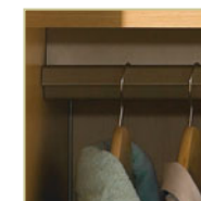
Safety Garment Rail

Cabinet doors are fitted with commercial quality hinges that provide 170 degrees or full opening.