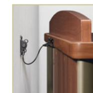
Anti-Tip Security Kit

Wardrobe cabinets offer additional hanging storage with a safety garment hook.