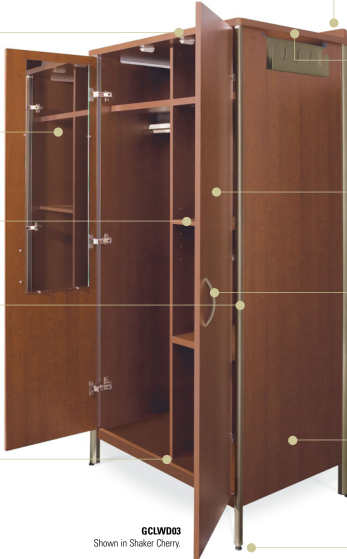
GCLWD03 Shown in Shaker Cherry.

A drainage reveal is provided at the front of the wardrobe base so that mishaps are quickly evident to housekeeping staff. The reveal is fitted with a polymer liner for durability and easy cleaning. The drainage reveal works with the upper ventilation openings to promote proper airflow in the wardrobe.