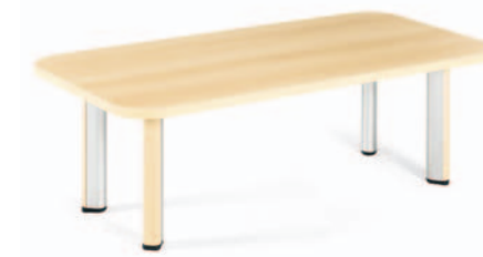
GC4109R Rectangular Table in Avant Maple (W358)