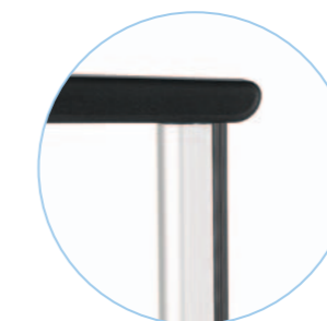
SSU Armcap, PVC Front Leg Cap