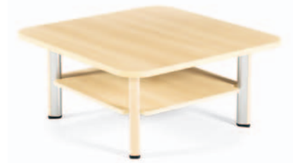
GC4108SMR Square Magazine Table in Avant Maple (W358)