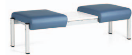
GC4134CT Two Seat Bench, Center Tablet