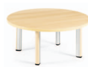
GC4108C Round Table in Avant Maple (W358)