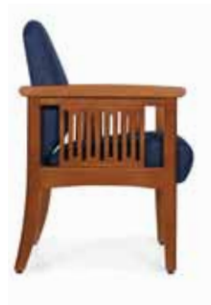
Linear Open Wood Arms