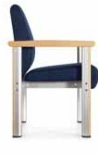
Wood Arms / Wood Front Leg Cap