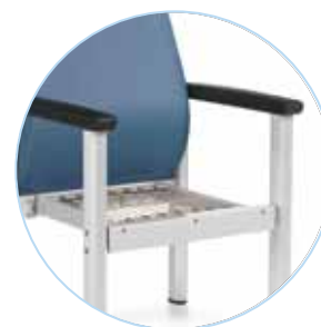
Perma-Mesh™ Suspension with 2" steel frame

Global - Canada The Global Group, 1350 Flint Rd., Downsview ON Canada M3J 2J7 Sales & Marketing: Tel (1-877) 446-2251 Customer Service: Fax (800) 361-3182 Government Customer Service: Fax (416) 739-6319