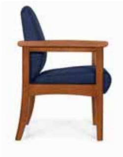
Open Wood Arms