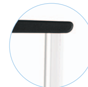
SSU Armcap, Silver Aluminum Front Leg Cap