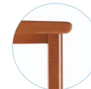
Wood Armcap, Wood Leg