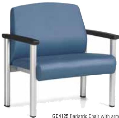
GC4125 Bariatric Chair with arms

The Bariatric model accommodates people up to 750lbs. A wider seat and heavy duty durable frame provides exceptional support and comfort. It can be used as a stand alone chair or it can be linked to other table or chair components.