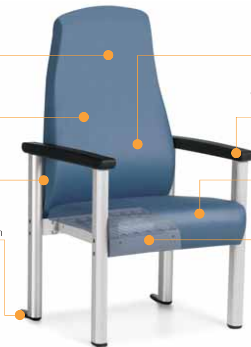
GC4101 High back chair with arms Shown in Lustre (LU11) Azurite Vinyl

Please refer to the Interlock Price List for sample configurations and a listing of the complete Interlock Series product line.