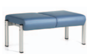
GC4132 Two Seat Bench