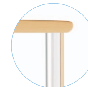
Wood Armcap, Wood Front Leg Cap