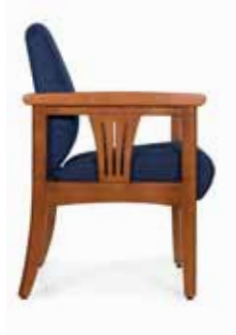
Fluted Open Wood Arms